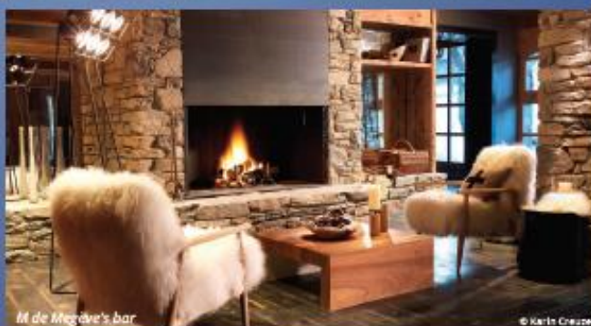
M de Megève's bar