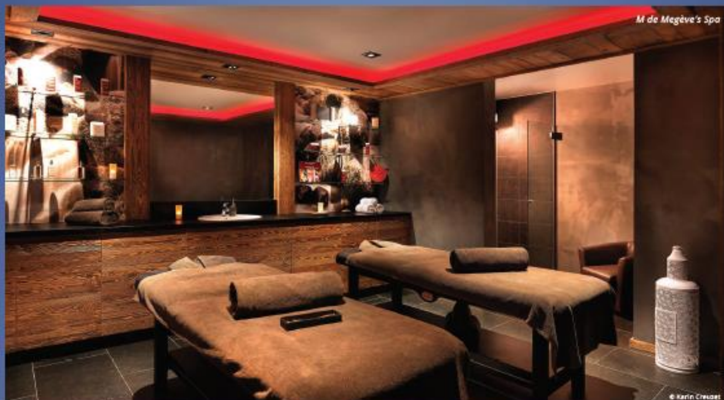
M de Megève's Spa

The M de Megève takes you on a horse-drawn carriage ride for a romantic moment in the heart of the village, the M de Megève offers guests an unforgettable ride in its horse-drawn carriage. Standing proudly in front of the 5* hotel, the carriage is decorated with the hotel's colours. Snuggle down under a woolen Arpen rug and enjoy the ride in the carriage, with its driver, pulled by Harmonie, the Swiss mare, brought up on Megève's high mountain pastures.