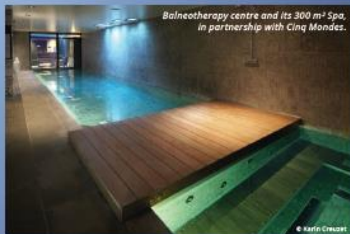
Balneotherapy centre and its 300 m 2 Spa, in partnership with Cinq Mondes.