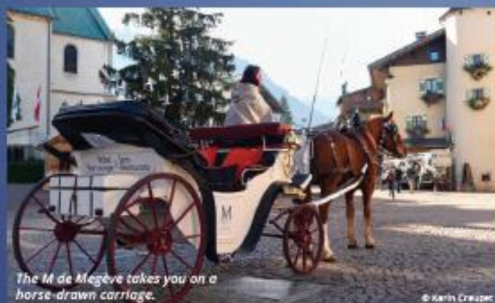
The M de Megève takes you on a horse-drawn carriage.