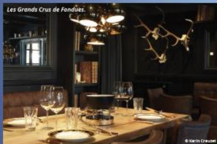
Les Grands Crus de Fondues.